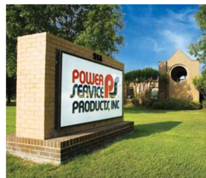
Power Service corporate offices