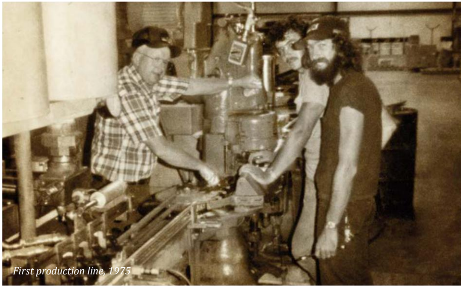
First production line, 1975