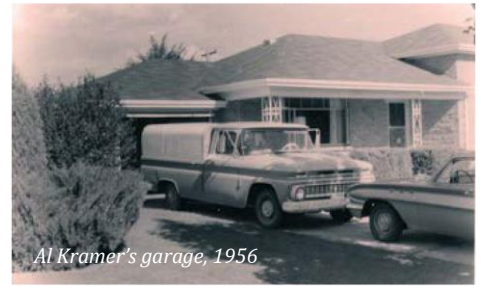
Al Kramer's garage, 1956